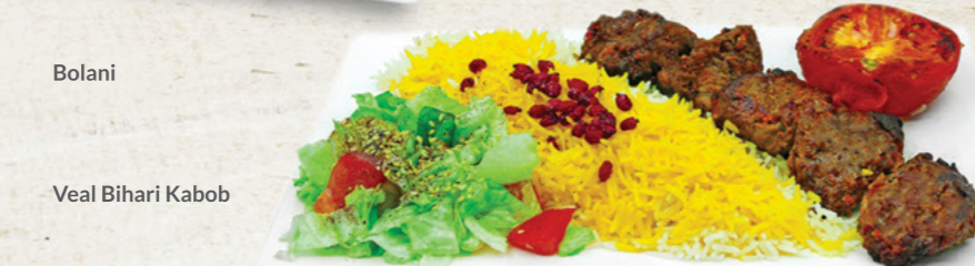
Veal Bihari Kabob