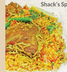
Shack's Special Chicken Biryani