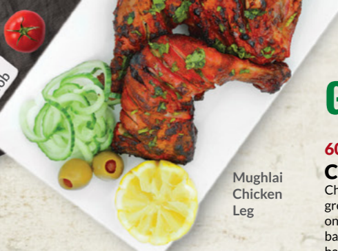
Mughlai Chicken Leg